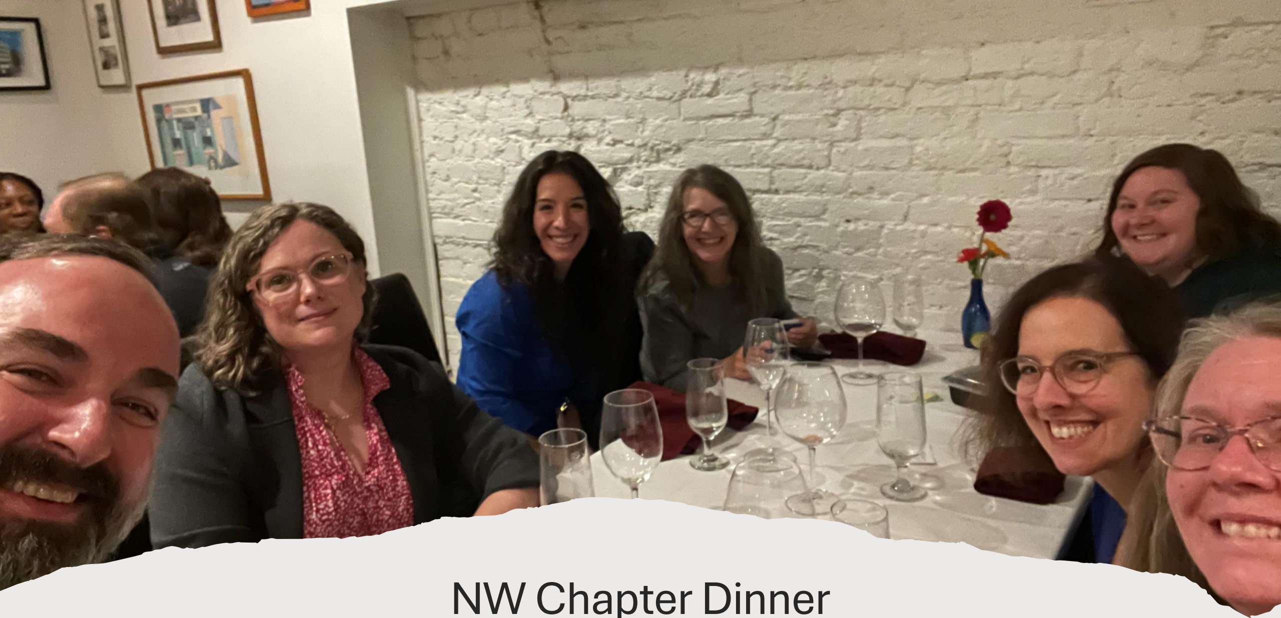
NW Chapter Dinner